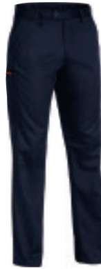
WESTEX ULTRASOFT® FR WORK PANT | BP8010