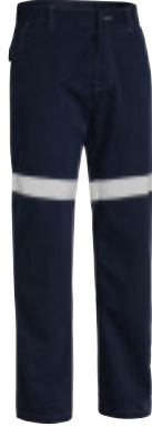
TENCATE TECASAFE PLUS TAPED LIGHTWEIGHT FR PANT CARGO PANT | BP8190T