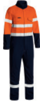
TENCATE TECASAFE® PLUS 580 TAPED TWO TONE HI VIS LIGHTWEIGHT FR NON VENTED ENGINEERED COVERALL | BC8186T