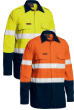
TENCATE TECASAFE® PLUS TAPED TWO TONE HI VIS LIGHTWEIGHT FR VENTED SHIRT | BS8237T