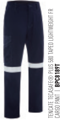
TENCATE TECASAFE® PLUS 580 TAPED LIGHTWEIGHT FR CARGO PANT | BPC8189T