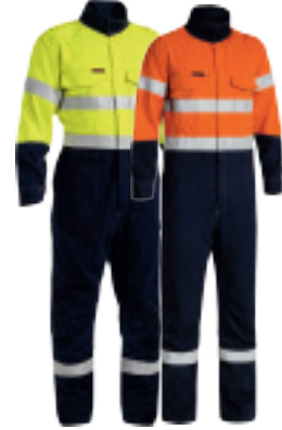
TENCATE TECASAFE® PLUS 700 TAPED TWO TONE HI VIS ENGI- NEERED FR VENTED COVERALL | BC8086T