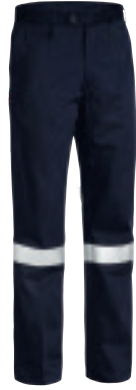
WESTEX ULTRASOFT® 3M TAPED FR WORK PANT | BP8000