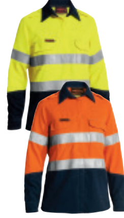
WOMENS TENCATE TECASAFE® PLUS TAPED TWO TONE HI VIS LIGHTWEIGHT FR VENTED SHIRT | BL8098T