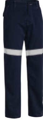
TENCATE TECASAFE® PLUS TAPED LIGHTWEIGHT FR PANT CARGO PANT | BP8190T