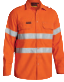
TENCATE TECASAFE® PLUS 700 TAPED HI VIS FR VENTED SHIRT | BS8081T