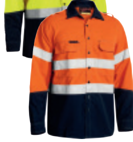
TENCATE TECASAFE® PLUS 700 TAPED TWO TONE HI VIS FR VENTED SHIRT | BS8082T