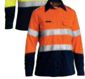
WOMENS TENCATE TECASAFE® PLUS = TAPED TWO TONE HI VIS FR VENTED SHIRT | BL8082T