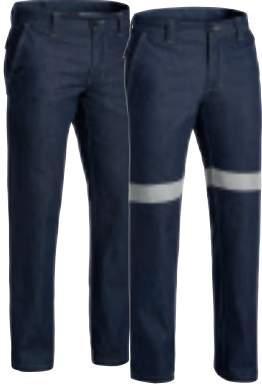
3M TAPED FR DENIM JEAN | BP8091 (BP8091TT TAPED)