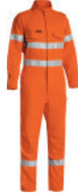
TENCATE TECASAFE® PLUS 580 TAPED HI VIS LIGHTWEIGHT FR NON VENTED ENGINEERED COVERALL | BC8185T