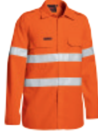
TENCATE TECASAFE® 480 TAPED HI VIS LIGHTWEIGHT FR VENTED SHIRT | BS8238T