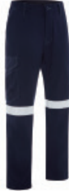
TENCATE TECASAFE® PLUS 580 TAPED LIGHTWEIGHT FR CARGO PANT | BPC8189T