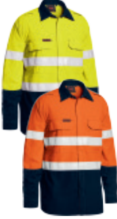
TENCATE TECASAFE® PLUS 480 TAPED TWO TONE HI VIS LIGHTWEIGHT FR VENTED SHIRT | BS8237T