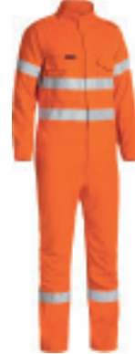
TENCATE TECASAFE® PLUS 700 TAPED HI VIS ENGINEERED FR VENTED COVERALL | BC8085T