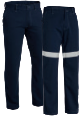
TENCATE TECASAFE® PLUS 700 TAPED FR PANT | BP8090 (BP8090T TAPED)