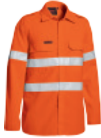
TENCATE TECASAFE® PLUS 480 TAPED HI VIS LIGHTWEIGHT FR VENTED SHIRT | BS8238T