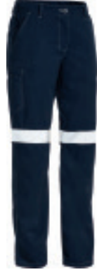
WOMENS TENCATE TECASAFE® 700 PLUS TAPED FR ENGINEERED CARGO PANT | BPL8092T