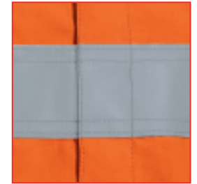
Reflective taped hoop pattern