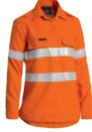
WOMENS TENCATE TECASAFE® PLUS TAPED HI VIS LIGHTWEIGHT FR VENTED SHIRT | BL8097T