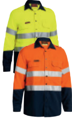
TENCATE TECASAFE® PLUS TAPED TWO TONE HI VIS LIGHTWEIGHT FR VENTED SHIRT | BS8098T